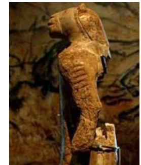
Image source: Lion-Human of Hohlenstein Stadel Close-up of upper half. (Lowenmensch) c.30,000 BCE Ulmer Museum, Ulm, Germany