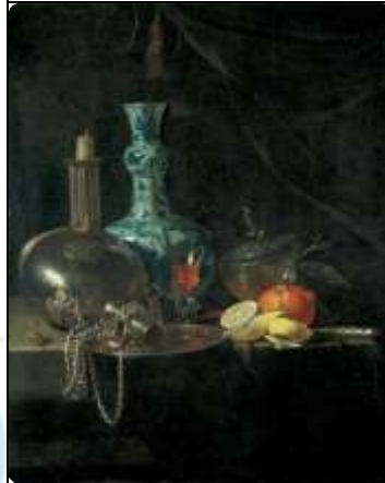
Still Life with a Pilgrim Flask, Candlestick, Porcelain Vase and Fruit by Willem Kalf